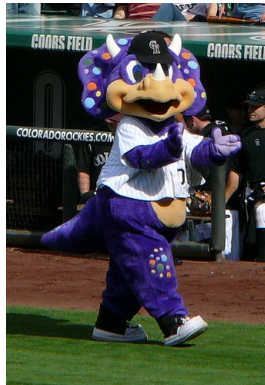
Wednesday, August 4: Colorado Rockies vs.