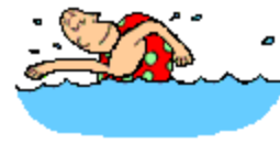
Wednesday, July 7: Swimming at Eisenhower Rec. Center