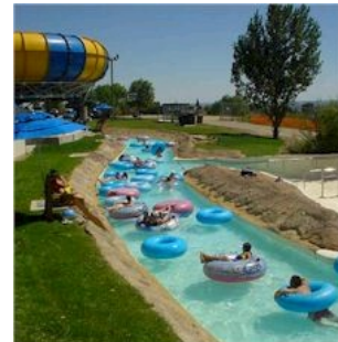
Wednesday, August 11: Waterworld

Cool off, relax and enjoy the sunshine this summer with the HEA! Turn page over for program descriptions, times and costs.