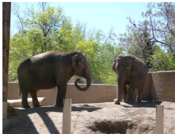
Wednesday, June 23: The Denver Zoo