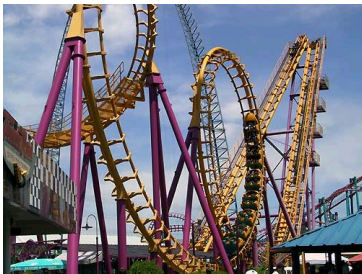
Wednesday, June 16: Elitches

Come to all the events or to just a few, but the HEA has something fun for you: